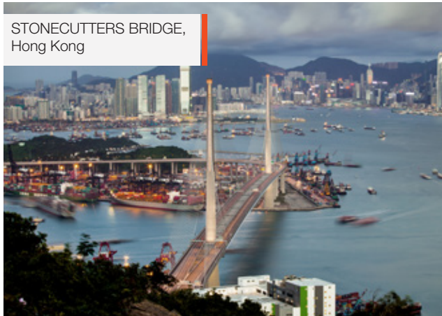
STONECUTTERS BRIDGE, Hong Kong