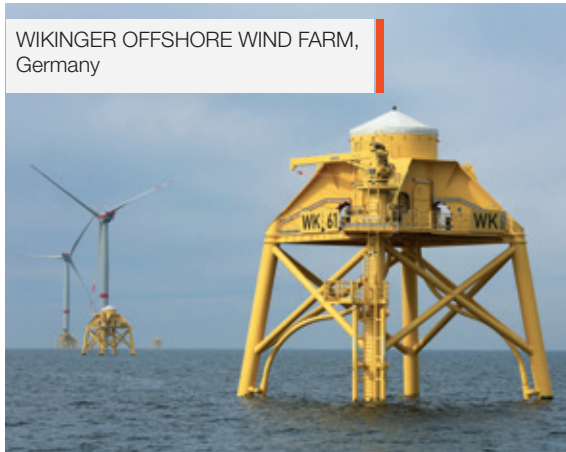
WIKINGER OFFSHORE WIND FARM, Germany