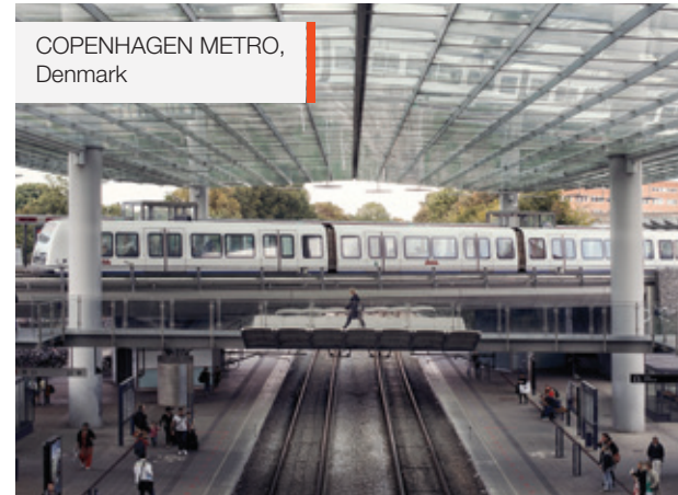
COPENHAGEN METRO, Denmark