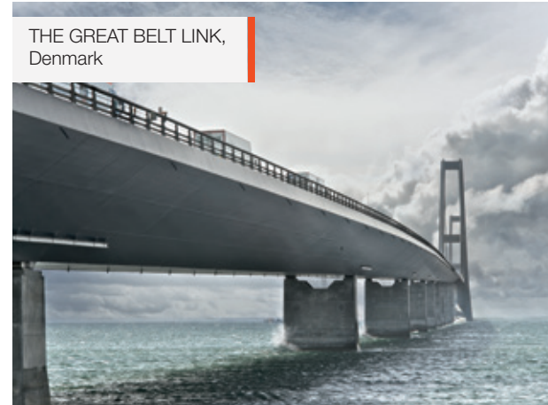
THE GREAT BELT LINK, Denmark