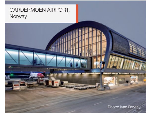
GARDERMOEN AIRPORT, Norway