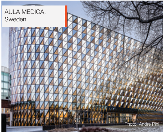
AULA MEDICA, Sweden